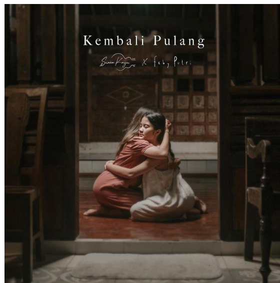
Figure 1: Poster of the song " Kembali Pulang "